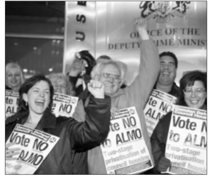
Celebrating the Camden 77% No Vote against ALMOs

story. To stop the council intimidating housing workers it is important that the council unions hold meetings of their members as early as possible. All the council unions oppose housing privatisation. They can provide speakers to explain the union's national policy and many have special campaign funds to help branches who want to produce local material to distribute to their members and to all tenants.