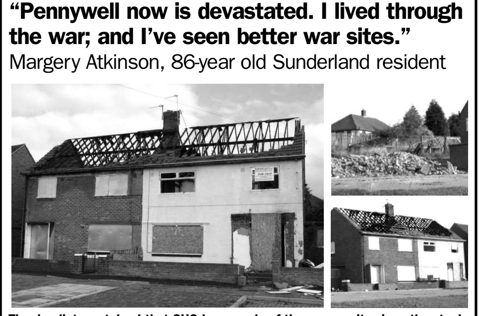
The derelict wasteland that SHG have made of the community since they took over council housing in Sunderland. Now they want to do the same here.

SEDGEFIELD COUNCIL wants to sell off our homes. They say we can't have all the improvements we want unless we transfer to a different landlord. But they don't spell out the risks or what we lose.