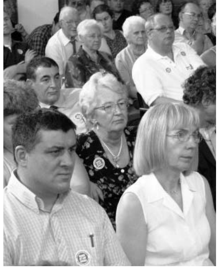
Delegates at the DCH National Conference on May 31 in Liverpool - see inside for report